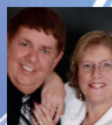
Heart To Heart